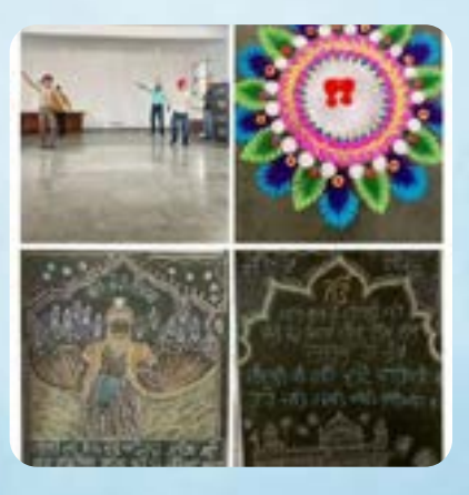
Activities at a Glance